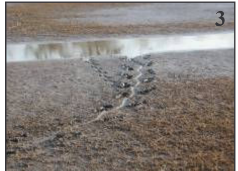
1. Response to displaced tanker trucks (Potassium Flouride & Molton Sulpher). Trucks were parked and abandoned prior to the Hurricanes making landfall. 2. Driving conditions in the Southern Louisiana roadways. 3. Alligator tracks near one of the field sites. Gators present a big hazard when recovering drums and other containers from Bayou areas.